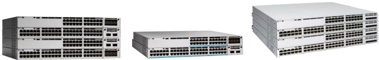
Figure 1. Cisco Catalyst 9300 Series switches Network Modules

The Cisco Catalyst 9300 Series is made up of nineteen modular uplink switch models and fourteen fixed uplink switch models.